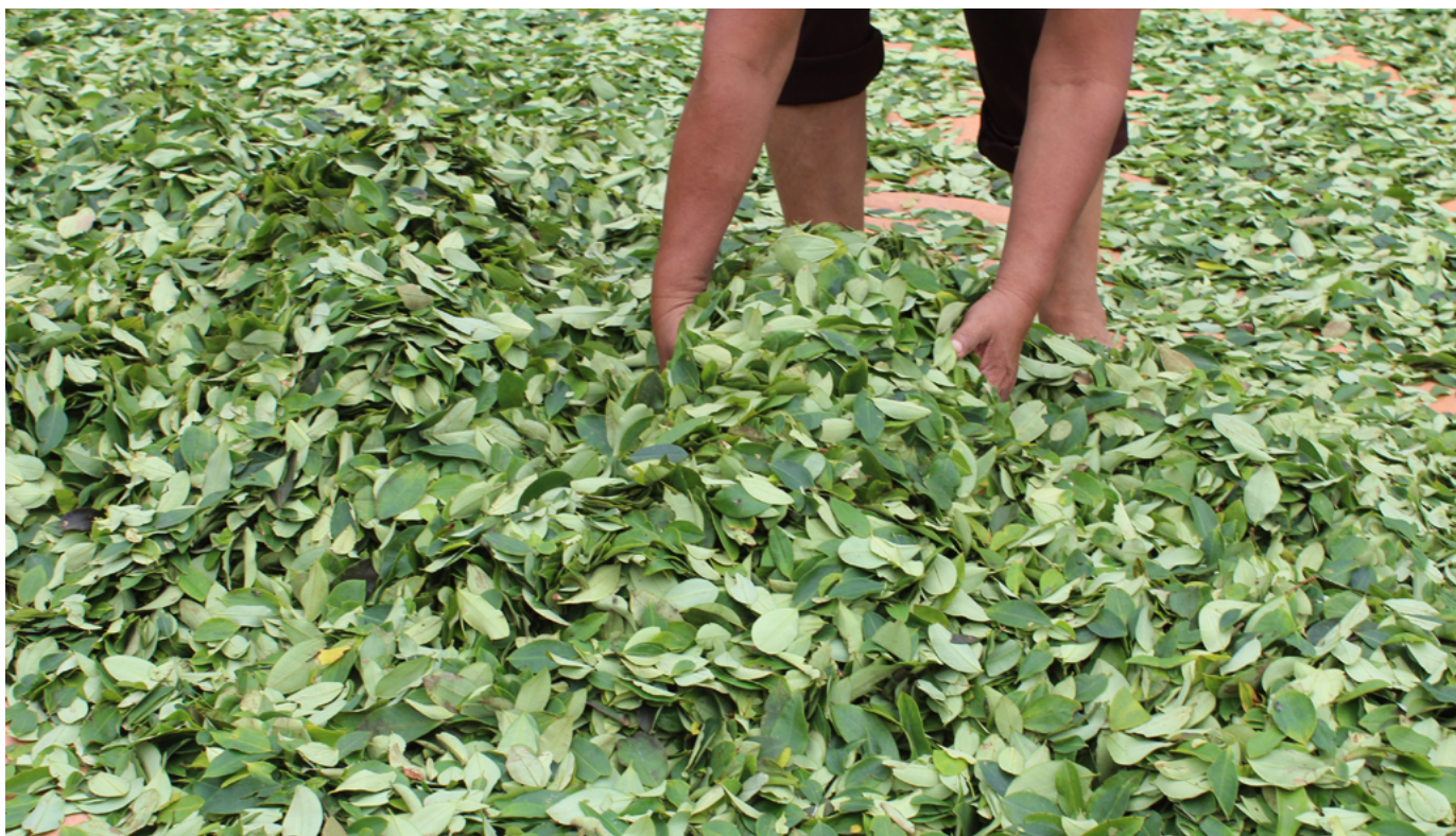
Coca is dried in Bolivia.

following the same treaty procedure, but there are differences to be taken into account. The main legal issue relates to article 19 of the VCLT, which requires that a reservation must not be "incompatible with the object and purpose of the treaty." Those overall aims of the Single Convention are expressed in the preamble's opening paragraph regarding concern about "the health and welfare of mankind" and the treaty's general obligation to limit controlled drugs "exclusively to medical and scientific purposes." Making a reservation exempting a particular substance from the treaty's general obligation to limit drugs exclusively to medical and scientific purposes is explicitly mentioned in the Commentary on the Single Convention as an option that could be procedurally allowable, for coca leaf as well as for cannabis. 47 While the absence of any accompanying cautionary text seems to imply that exemption by means of a reservation of a specific substance from the general obligations would not in itself constitute a conflict with the object and purpose of the treaty as a whole, this would certainly be an important legal discussion to be had in the context of crafting reservations. The same issues would arise with an inter se agreement (see above), which comes close to a form of "collective reservation."