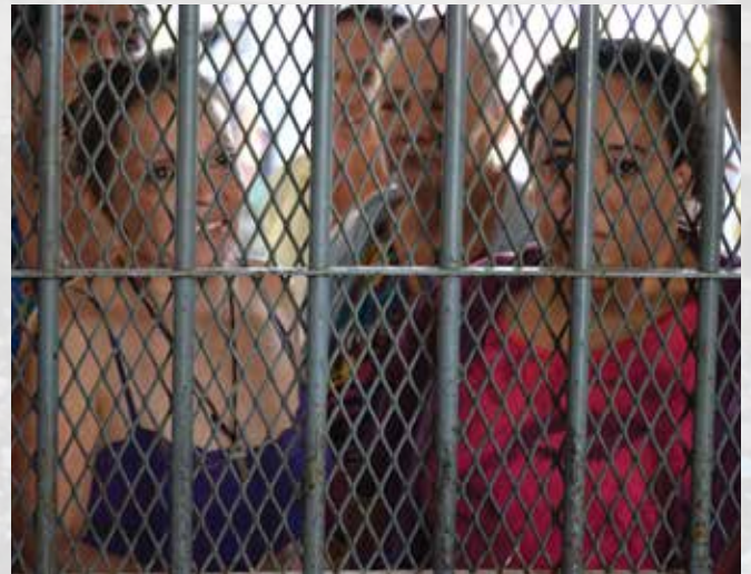
At the Buen Pastor prison in Costa Rica, WOLA's photo essays document how harsh sentences for minor drug offenses trap women in a cycle of poverty.