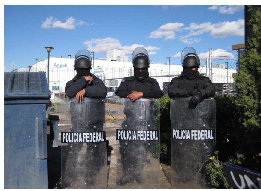
Federal Police in Ciudad Juárez, Mexico

In evaluating the "Todos Somos Juárez" program, the ongoing violence speaks volumes. At the end of 2010, the murder rate stood around 230 per 100,000 residents. There were at least 800 drug-related murders in the city in the first four months of 2011. Several incidents have shown the security risks Juárez residents continue to face as they go about their daily lives. In a tragic irony, on January 23, 2011, seven soccer players and fans were gunned down by an armed group of individuals before the match began; the field had recently been constructed with funds from