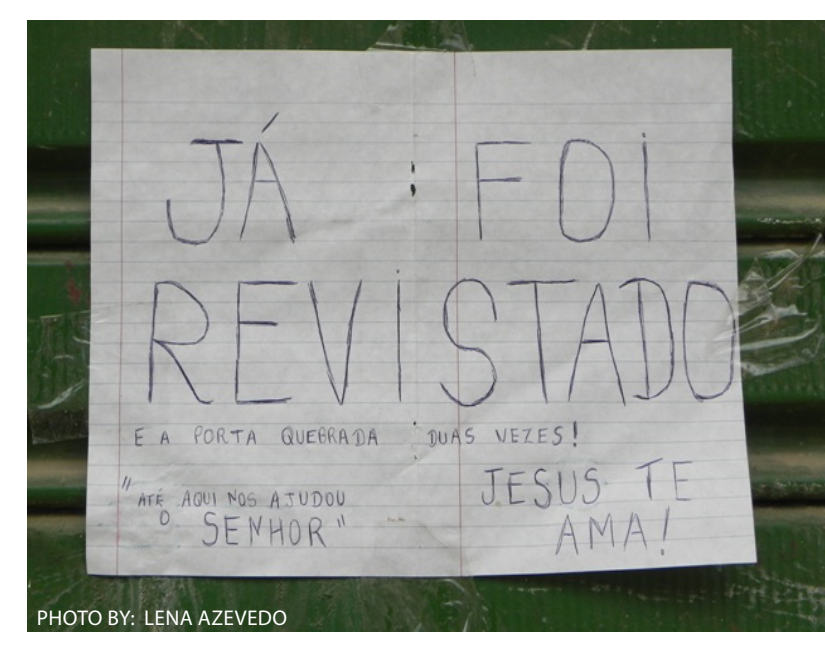
"ALREADY BEEN SEARCHED...and the door broken twice" reads a note left by a resident in Complexo do Alemão, imploring police not to break in again.

Despite these obstacles, the UPP seems to be relatively well received. A recent study interviewed residents in eight favelas with UPP and found 83% characterizing their community's security situation as "better" or "much better" compared to a year before, and 72% saying