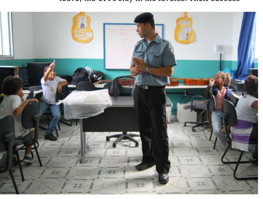
A UPP officer teaches a computer technology class to children in the Babilônia favela.

The units are made up of fresh recruits who have not yet hit the streets, and therefore presumably are not tainted by corruption. They earn a higher salary in the hope that they will have less incentive to take kickbacks. Before deployment UPP officers receive specialized training in community relations with an emphasis on human rights and conflict resolution. The UPP has traditional policing roles, but great importance is placed on rebuilding community relations. As part of their routine, all officers perform community service, mostly teaching young children-from music to karate to computer sciences—to try to transform the historically conflictive community-police relationship. The UPP is billed as a "territorial recovery" program, but rather than clear out the drug traffickers and leave, the UPPs stay in the favelas. Their success