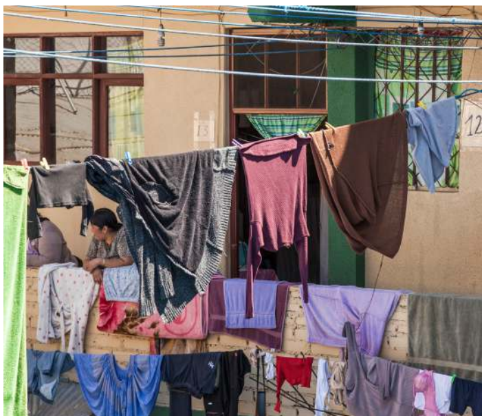
Clothes drying in the courtyard of the San Sebastian women's prison in Cochabamba, Bolivia.

procedures code eliminated special drug courts, strong state and societal pressure on judges to convict drug offenders persists. Similarly while pretrial detention is no longer mandated by law as a result of the 1999 reform, in practice it continues to be the norm for drug offenses.