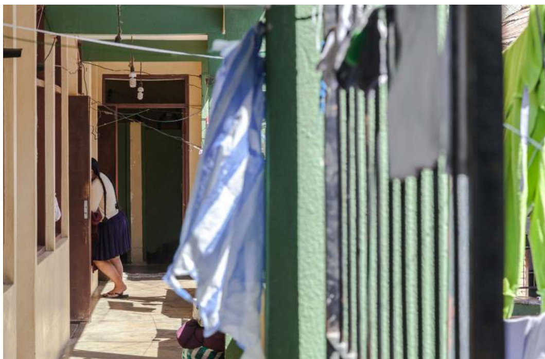
A woman incarcerated in the San Sebastian Prison in Cochabamba, Bolivia.

Finally, the voices of women impacted by drug policies must be included in the debate, in order to develop and implement more effective, humane and inclusive initiatives, grounded in public health and human rights.