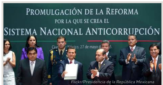
President Enrique Peña Nieto signs the National Anti-Corruption System into law in Mexico City (May 27, 2015)

While President Enrique Peña Nieto's administration has not demonstrated the political will needed to make this system effective (having attempted to block several important anti-corruption probes from moving forward), the next Mexican government will be able to build upon this existing framework. The degree to which this happens, as well as the extent to which the incoming federal government commits to effectively implementing the new Fiscalía General and to supporting anti-corruption efforts at the state level, will be clear indicators of whether Mexico will at last be able to turn the tide on the rising number of corruption and criminal collusion cases that have shaken the country in recent years.