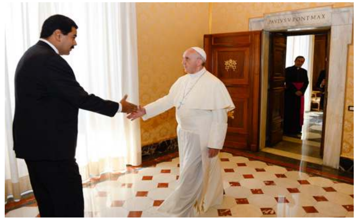
Pope Francis welcomes Nicolás Maduro at the Vatican, 2013.

suspended the procedure, there were protests and calls for a massive march on the presidential palace, with a high likelihood of violence.<sup>8</sup> The sides met on October 23 and then again on November 11-12 in negotiation in which the Vatican squarely placed its reputation and political capital on the line as guarantors of the process. On November 12 the sides jointly released a five-point agreement: regularizing the situation of the National Assembly and naming new rectors to the National Electoral Council, defense of the Essequibo region from territorial claims of neighboring Guyana, mutual recognition and coexistence, and the inclusion of governors and civil society in continued dialogue.