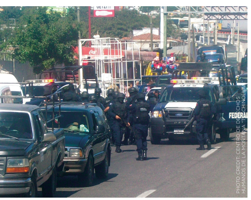
Federal Police officers respond to the student protest in Ayotzinapa, Guerrero, in 2011.

"The agreement committed all parties to adopt and abide by guidelines for the treatment of detainees, especially regarding the chain of custody, detention, and presentation of detainees to legal authorities, as well as on the legitimate use of force."