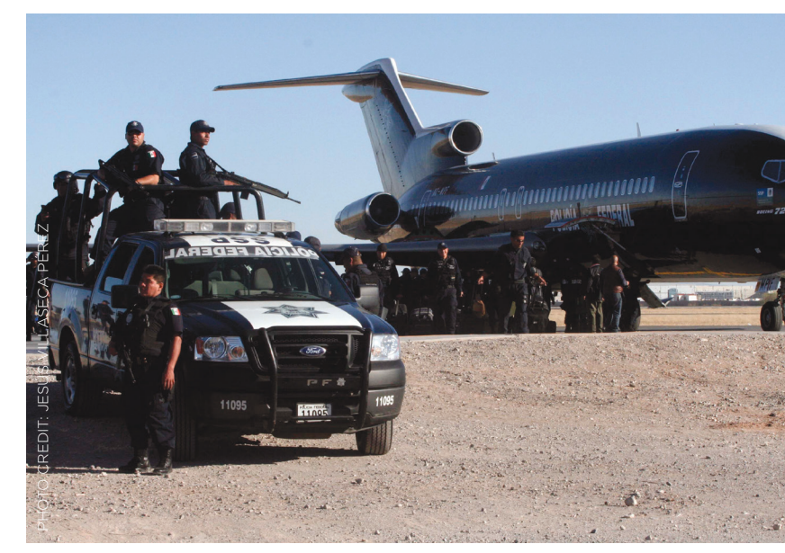
Federal Police sent to reinforce security in Ciudad Juárez.

The Merida Initiative has provided assistance for many of the police reform initiatives described in this report. As of December 2013, the United States' government reported that it had provided "[US]$8 million of training and equipment support to the national vetting program at the state and federal levels" and characterized this system as "a major effort by the GOM [Government of Mexico] to stamp out corruption and build trustworthy institutions."91 In an April 2010 report to Congress, the State Department expressed its intention to provide INCLE funds to increase Mexico's polygraph capability and internal controls, including providing Mexico with 300 polygraph units. Merida funds have also supported Mexico's Police Registry. Approximately US$8.8 million in INCLE funds have been designated to "expand and enhance the Registry and make it available nationwide." The support was primarily for equipment to capture biometric data, hardware to host the Registry, and training of officials in the capture, storage, and retrieval of biometric information.92 As of 2013, the United States had provided training to over 4,500 Federal Police officers on investigative techniques, evidence collection, crime scene preservation, and ethics. State and municipal police have also received training through the Merida