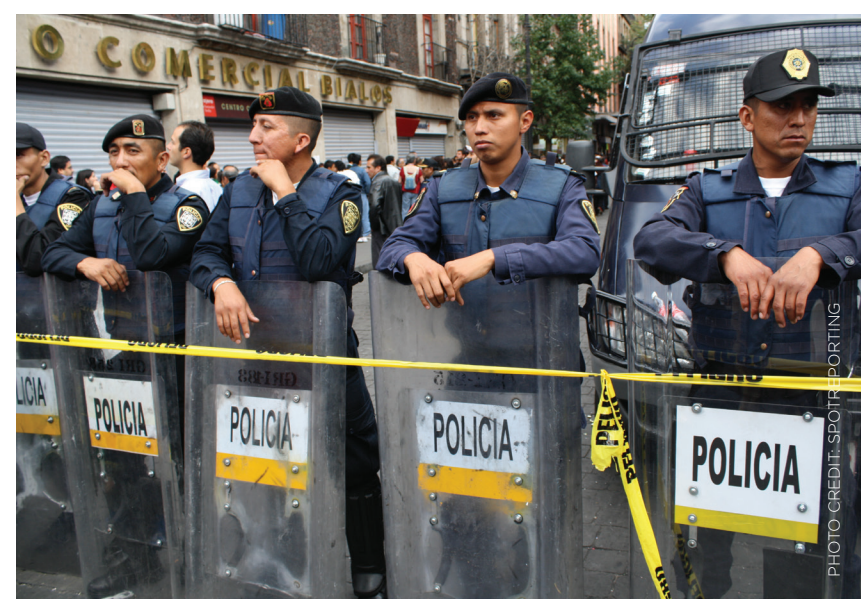
Police presence during bicentennial celebration in Mexico City.

Municipal police make up the largest percentage of the police forces in Mexico, and at this level the Calderón administration began the Municipal Security Subsidy (Subsidio para la Seguridad en los Municipios, SUBSEMUN) in 2008. SUBSEMUN funds are provided to municipalities for the professionalization of public security forces, to improve police infrastructure, and to develop crime prevention policies. Municipalities are chosen based on population and crime rates. Tourist destinations, border cities, primarily urban municipalities, and municipalities that are affected by the high crime rates of adjacent municipalities are given special consideration.31 The Executive Secretary of the SNSP determines the number of municipalities eligible each year. On average, the municipalities receiving support accounted for approximately 64 percent of Mexico's population.<sup>32</sup> For 2012, the last year Calderón was in office, the program's resources were distributed to 239 municipalities in Mexico (out of 2,457 municipalities in the country and 16 boroughs in Federal District). In 2013, 251 municipalities received the subsidy, while 268 municipalities will be receiving the subsidy in 2014.33 SUBSEMUN provided more than US$390 million to municipalities in 2013 and 2014.