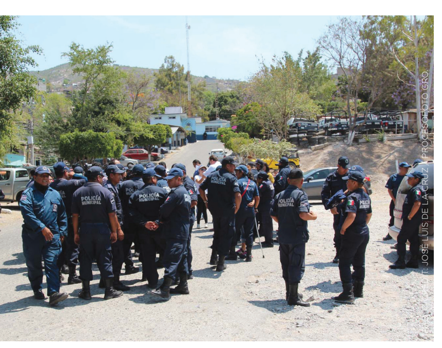
Municipal police in Guerrero State protest, demanding that the results of control de confi- anza exams be made public.

audit by the government's federal auditing agency (Auditoría Superior de la Federación, ASF) as there is little clarity about how the federal government will support police development in the rest of Mexico's municipalities' and ensure their participation in the National Public Security System.