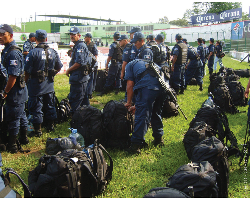
Federal Police officers getting ready to be sent to different communities.

adjustments to the security strategy in the country while keeping in place what was working. 94 Peña Nieto has emphasized that his security priorities are to reduce crime and violence in Mexico rather than combatting drug trafficking organizations and efforts have been made to increase coordination between federal, state, and municipal public security agencies. However, his administration has largely maintained the initiatives and police model that were put into place during the Calderón administration. He has also continued to rely heavily on the military to combat organized crime and provide public security, deploying the armed forces in new security operations in Michoacán, Guerrero, the State of Mexico, and elsewhere, and there are no announced plans to return the military to its barracks. In fact, the National Defense Plan for 2013-2018 explicitly states that the military will be involved in the provision of public security throughout Peña Nieto's sexenio (six-year term): "the current problems in our country require having more troops in national territory to continue carrying out diverse operations, to provide assistance to the civilian population in the case of disasters, and to continue to help civil authorities in public security roles." 95