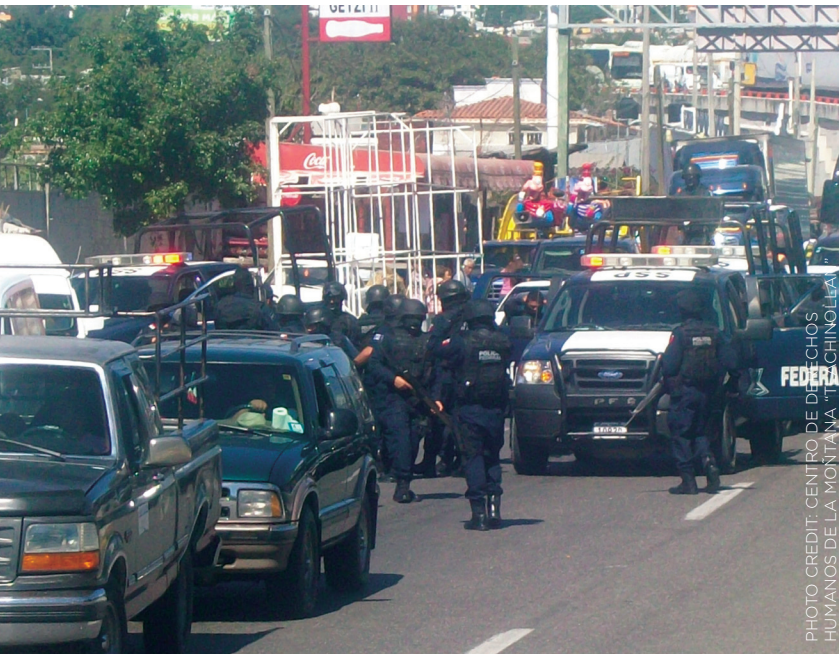
Federal Police officers respond to the student protest in Ayotzinapa, Guerrero, in 2011.

"The agreement committed all parties to adopt and abide by guidelines for the treatment of detainees, especially regarding the chain of custody, detention, and presentation of detainees to legal authorities, as well as on the legitimate use of force."