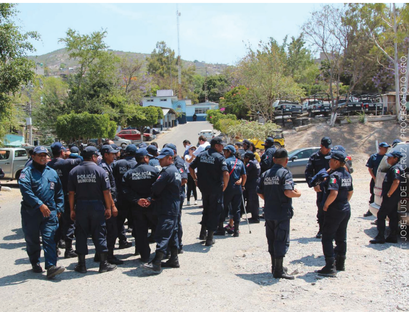
Municipal police in Guerrero State protest, demanding that the results of control de confianza exams be made public.

audit by the government's federal auditing agency ( Auditoría Superior de la Federación, ASF ) as there is little clarity about how the federal government will support police development in the rest of Mexico's municipalities' and ensure their participation in the National Public Security System.