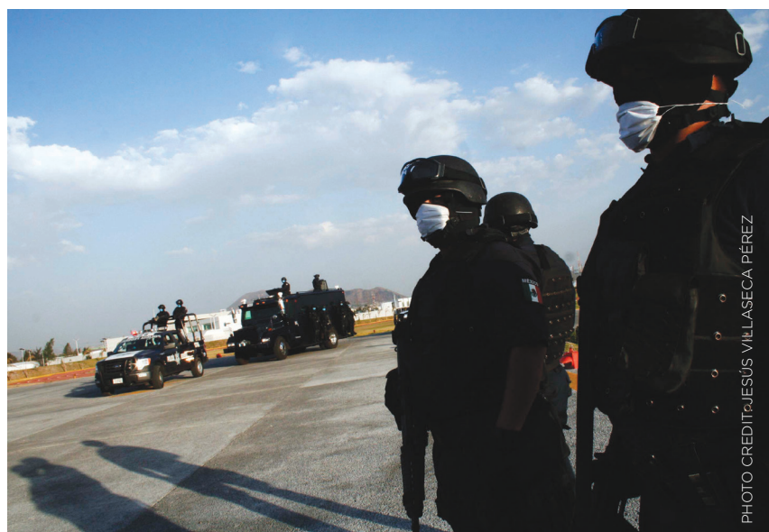
Federal Police officers wait to receive captured drug traffickers at an airport in Mexico City.

Presidents Miguel de la Madrid (1982-1988) and Carlos Salinas de Gortari (1988-1994) both took some steps to reform the police, including de la Madrid's dissolution of the notoriously corrupt Federal Security Directorate ( Dirección Federal de Seguridad , DFS) in 1986. But it was not until the presidency of Ernesto Zedillo (1994-2000) that significant changes to Mexico's police and security institutions began to take shape. In 1995, the Zedillo administration oversaw the