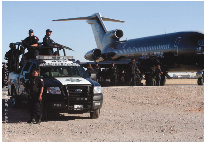
Federal Police sent to reinforce security in Ciudad Juárez.

The Merida Initiative has provided assistance for many of the police reform initiatives described in this report. As of December 2013, the United States' government reported that it had provided "[US]$8 million of training and equipment support to the national vetting program at the state and federal levels" and characterized this system as "a major effort by the GOM [Government of Mexico] to stamp out corruption and build trustworthy institutions." 91 In an April 2010 report to Congress, the State Department expressed its intention to provide INCLE funds to increase Mexico's polygraph capability and internal controls, including providing Mexico with 300 polygraph units. Merida funds have also supported Mexico's Police Registry. Approximately US$8.8 million in INCLE funds have been designated to "expand and enhance the Registry and make it available nationwide." The support was primarily for equipment to capture biometric data, hardware to host the Registry, and training of officials in the capture, storage, and retrieval of biometric information. 92 As of 2013, the United States had provided training to over 4,500 Federal Police officers on investigative techniques, evidence collection, crime scene preservation, and ethics. State and municipal police have also received training through the Merida