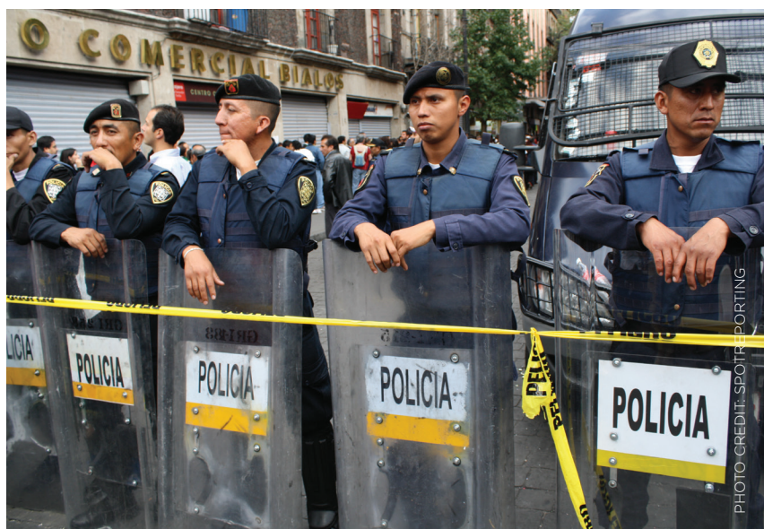
Police presence during bicentennial celebration in Mexico City.

Municipal police make up the largest percentage of the police forces in Mexico, and at this level the Calderón administration began the Municipal Security Subsidy ( Subsidio para la Seguridad en los Municipios , SUBSEMUN) in 2008. SUBSEMUN funds are provided to municipalities for the professionalization of public security forces, to improve police infrastructure, and to develop crime prevention policies. Municipalities are chosen based on population and crime rates. Tourist destinations, border cities, primarily urban municipalities, and municipalities that are affected by the high crime rates of adjacent municipalities are given special consideration. 31 The Executive Secretary of the SNSP determines the number of municipalities eligible each year. On average, the municipalities receiving support accounted for approximately 64 percent of Mexico's population. 32 For 2012, the last year Calderón was in office, the program's resources were distributed to 239 municipalities in Mexico (out of 2,457 municipalities in the country and 16 boroughs in Federal District). In 2013, 251 municipalities received the subsidy, while 268 municipalities will be receiving the subsidy in 2014. 33 SUBSEMUN provided more than US$390 million to municipalities in 2013 and 2014.