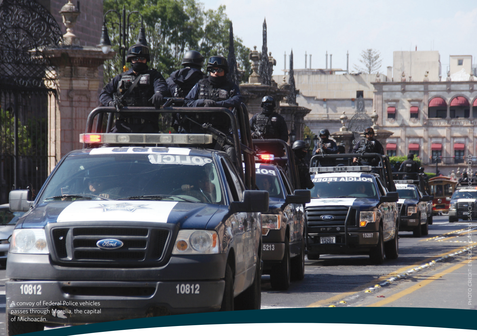
A convoy of Federal Police vehicles passes through Morelia, the capital of Michoacán.