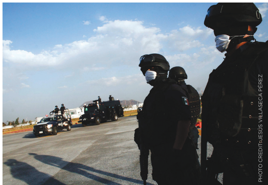
Federal Police officers wait to receive captured drug traffickers at an airport in Mexico City.

Presidents Miguel de la Madrid (1982-1988) and Carlos Salinas de Gortari (1988-1994) both took some steps to reform the police, including de la Madrid's dissolution of the notoriously corrupt Federal Security Directorate ( Dirección Federal de Seguridad , DFS) in 1986. But it was not until the presidency of Ernesto Zedillo (1994-2000) that significant changes to Mexico's police and security institutions began to take shape. In 1995, the Zedillo administration oversaw the