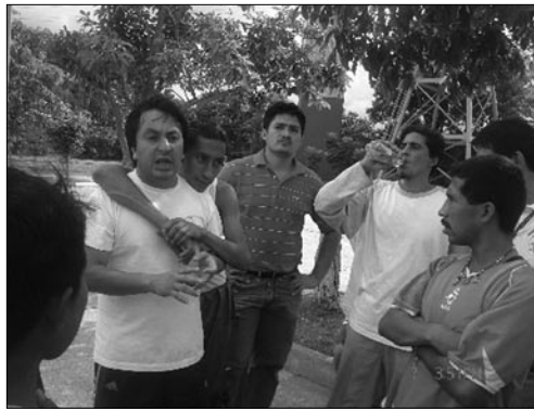
Guatemalan youth congregate at a rehabilitation center.

Several broad social factors contribute to youth violence in Central America. One of the factors most strongly associated with violent behavior by teens and young adults is exposure to violence in the home. Children who experience, or observe, violent behavior in the home are far more likely to engage in violence themselves. Unfortunately, intra-family violence is common in Central America. A study in El Salvador showed that physical violence is present in 80% of households there. 2 Studies show that domestic violence significantly increases the likelihood that a child will be the perpetrator of violent acts later on in life, whether they are domestic or social acts of violence. 3 In a survey of gang members in Honduras by the relief and development organization Save the Children, 38% stated that they had been beaten or abused on a regular basis during their youth. Of this group, 13.5% were beaten daily. 4 While intra-family violence is not the sole reason for