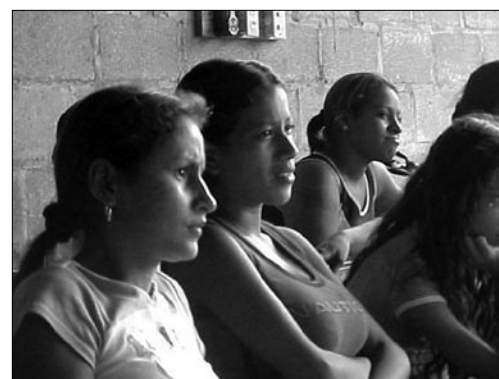
Young women at a center for at risk youth in Honduras.

Given these costs, effective violence prevention programs could save enormous