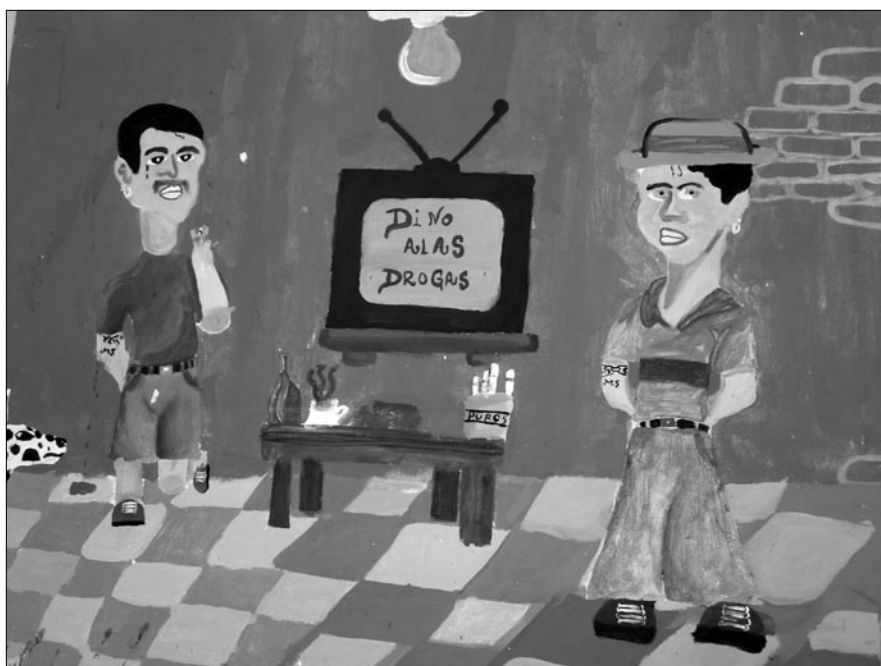
Painting by a young person participating in a prevention and rehabilitation program that reads, “Say no to drugs.”

Because evidence suggests that the most effective prevention programs build on community assessments and local partnerships, backed up by national resources, prevention program design should begin with a broad evaluation of the current situation in the various provinces and highly populated urban centers in each country, taking stock of the existing prevention, intervention, and rehabilitation programs run by community organization and churches. Because of a severe lack of resources and funding for social services in Central America, using these existing programs as a base to creating a comprehensive approach is the most cost