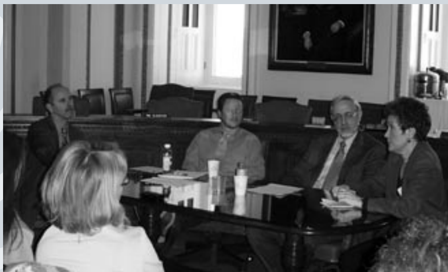
Briefing on Capitol Hill, Cuba After Castro , focused on the future impact of sectors within Cuba (December).