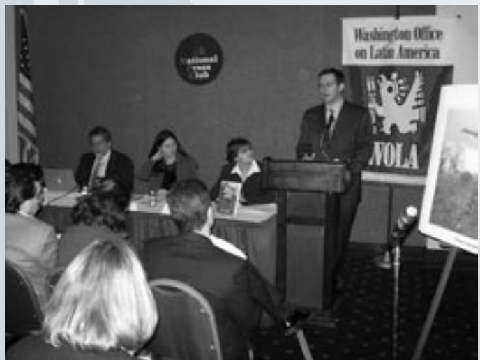
Release of Drugs and Democracy in Latin America: The Impact of U.S. Policy at the National Press Club (November).