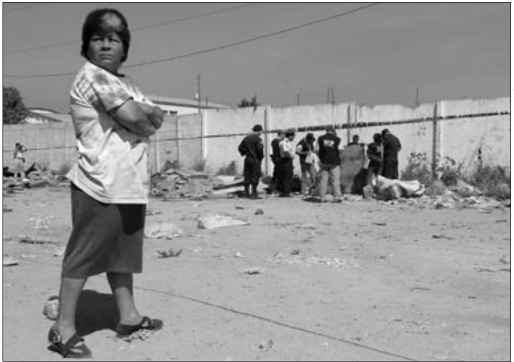
A neighbor observes as the police investigate at the scene of a murder of an unidentified woman in Guatemala City, Guatemala, Friday, November 25, 2005. According to the police, 580 women were murdered in Guatemala that year.