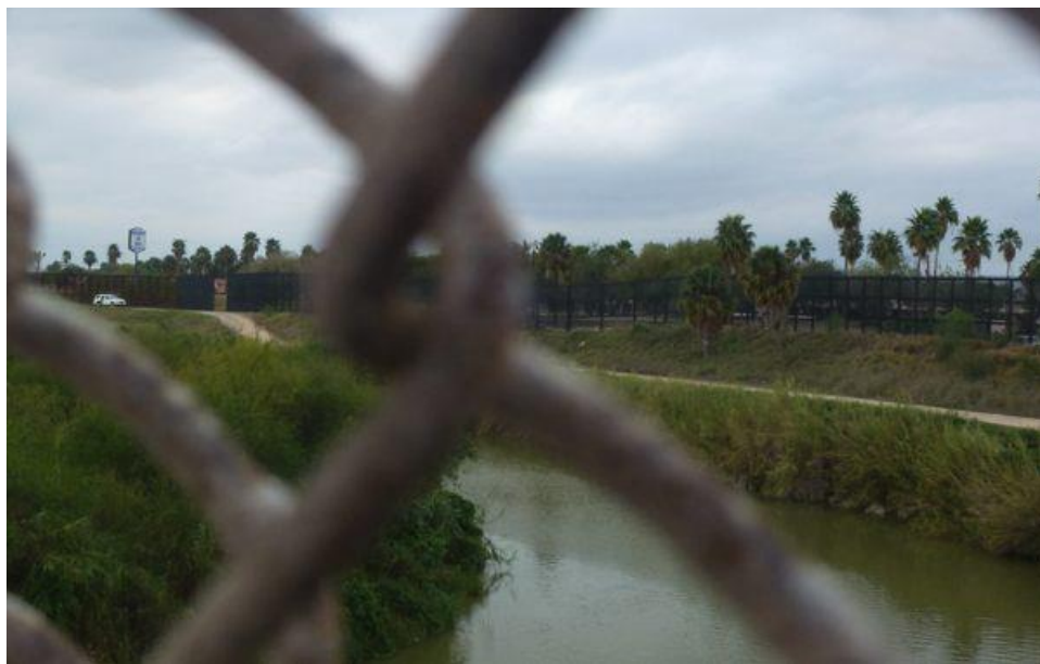
Border fence and Rio Grande, Brownsville, Texas

“Other than Mexicans”: Virtually all of this growth in migration, officials say, consists of “OTMs,” local authorities’ shorthand for “Other than Mexican”—chiefly, citizens of Honduras, Guatemala, and El Salvador. For the first time in any U.S.-Mexico border sector, non-Mexicans made up the majority of this year’s annual total of apprehended migrants in the Rio Grande Valley . The security crisis of Central America’s “Northern Triangle” countries, along with ongoing poverty and lack of employment opportunities, were the reasons most frequently cited by the officials and experts with whom we spoke. It is remarkable that Central Americans are increasingly traveling through this vector instead of trying to cross elsewhere; though it is the shortest distance from Central America, the Mexican state of Tamaulipas is notorious for the frequency and brutality of violence that criminal groups commit against migrants, including the August 2010 massacre of 72 migrants, mostly Central American, in San Fernando, Tamaulipas, just 100 miles from the U.S. border.