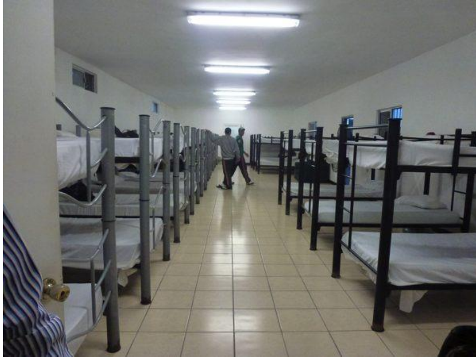
Migrant shelter, Matamoros, Mexico