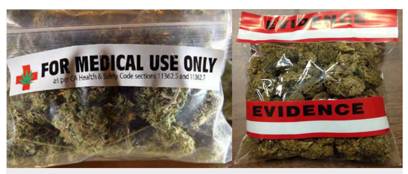
Above, cannabis as both a licit medical product and police evidence.