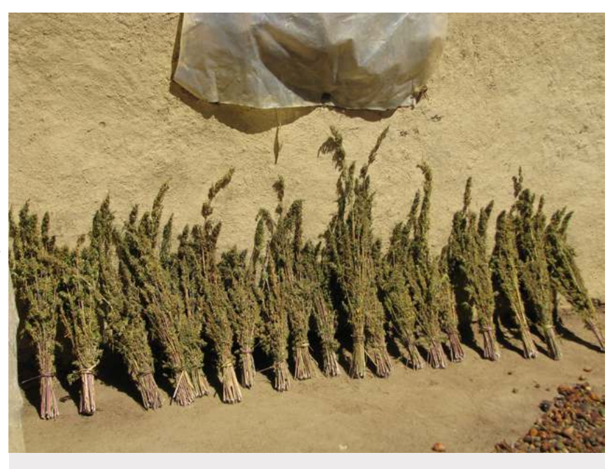
Cannabis drying in Morocco.

Moreover, what we can now see is that it is not the case that States will face significant condemnation from the international community for cannabis reforms that are increasingly common practice across the world. Opting for reform and acknowledging non-compliance can help set the stage for treaty reform options that can be implemented collectively among like-minded States, such as the inter se option.