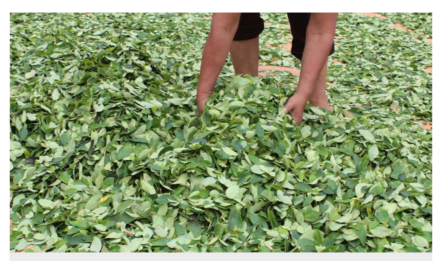
Coca is dried in Bolivia.

following the same treaty procedure, but there are differences to be taken into account. The main legal issue relates to article 19 of the VCLT. which requires that a reservation must not be "incompatible with the object and purpose of the treaty." Those overall aims of the Single Convention are expressed in the preamble's opening paragraph regarding concern about "the health and welfare of mankind" and the treaty's general obligation to limit controlled drugs "exclusively to medical and scientific purposes." Making a reservation exempting a particular substance from the treaty's general obligation to limit drugs exclusively to medical and scientific purposes is explicitly mentioned in the Commentary on the Single Convention as an option that could be procedurally allowable, for coca leaf as well as for cannabis.<sup>47</sup> While the absence of any accompanying cautionary text seems to imply that exemption by means of a reservation of a specific substance from the general obligations would not in itself constitute a conflict with the object and purpose of the treaty as a whole, this would certainly be an important legal discussion to be had in the context of crafting reservations. The same issues would arise with an inter se agreement (see above), which comes close to a form of "collective reservation."