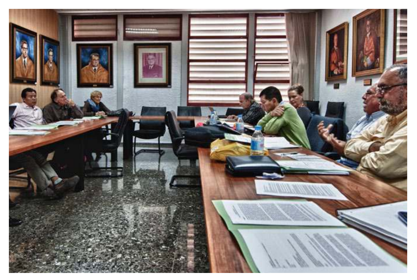
Valencia meeting at the Valencia Polytechnic University, experts from Peru, Colombia and Myanmar discuss Alternative Development

The UNGASS on the World Drug Problem was held in New York between April 19 and 21, 2016. This Special Session was originally planned for 2019, ten years after the 2009 High Level Segment in Vienna, but three Presidents (of Colombia, Mexico and Guatemala) called upon the world community to urgently discuss all possible scenarios, since current drug control strategies are failing to address the increasing violence related to drug markets in their countries. These countries argue that alternative policies should be discussed openly, with a focus on health, human rights,