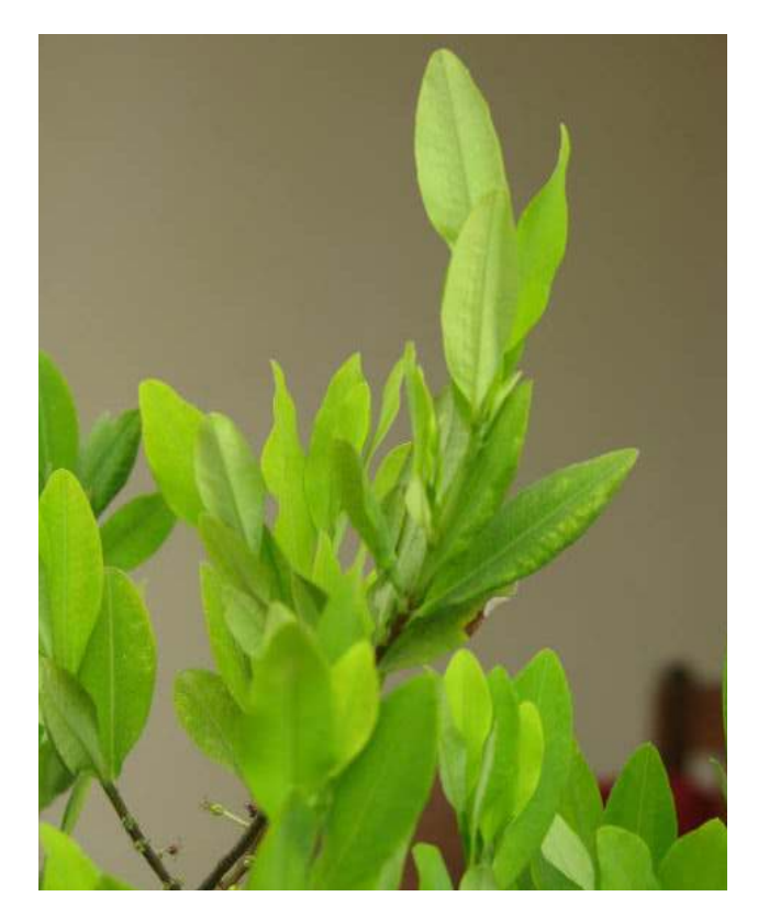
The coca plant

"Inside all indigenous houses there is something we call a Nazatul, which contains all the things necessary to survive. The coca leaf is part of that. It gives strength to the workers and