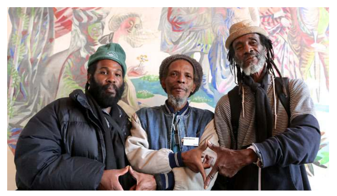
Three GFPPP participants from the Caribbean

few governments have defended the right to use these plants for traditional or ceremonial uses, and questioned the drug control regime for this reason.