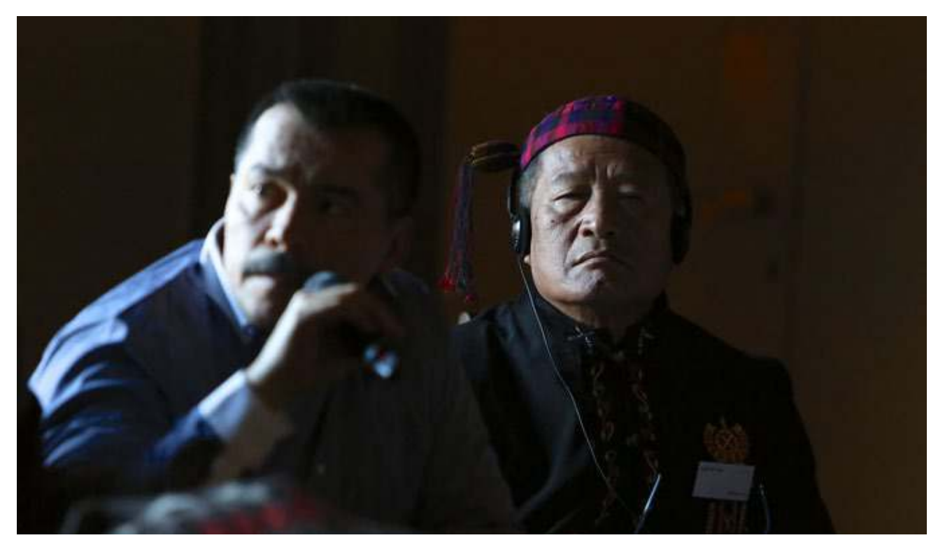
Delegates from Mexico and Myanmar participating in one of the working groups in Heemskerk

the conflict in our area is not so much existent because of business interests, but more because of political interests. We have many ethnic groups, but after the period of British colonisation, many of those groups are again fighting for political power. These conflicts often are fought in the mountainous zones. To fight a war you need an army, to have an army you need money. To find money in the mountains, you will need to find opium. It's a high value cash crop."