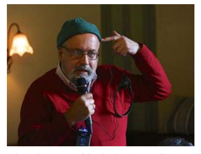
Delegate from Peru explains the situation regarding eradication in the coca producing valleys of his country

"The US government was responsible for eradications (marihuana), now it's done by our national police (on foot). The current president prefers the US to not be involved. The farmers, who do not want to be subjected to the eradications, grow higher up in the mountains. The difference in eradications by police and US; the police (on foot) eradicate more. After eradications, farmers grow again."