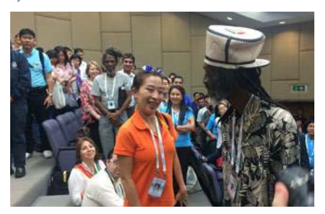
Steering Committee member Spirit speaking with Thai Royal Highness