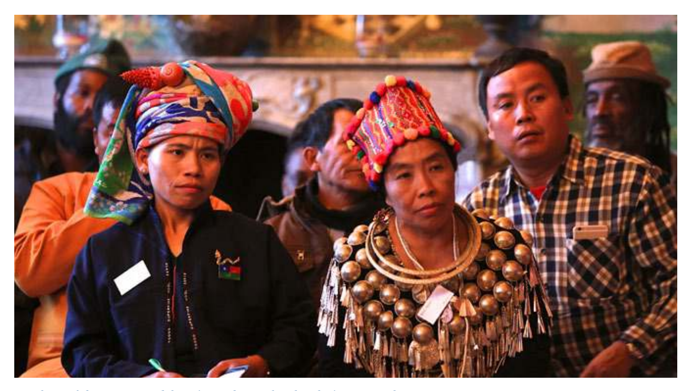
Members of the Myanmar delegation

The international drug conventions limit the use of opium poppy, coca and cannabis to exclusively scientific and medicinal purposes. The existing traditional uses of these plants are not recognised in the global drug control regime, although this exclusion has been challenged from the moment these conventions were negotiated. This omission has led to further polarisation of the debates about the validity of these legal instruments. Only very