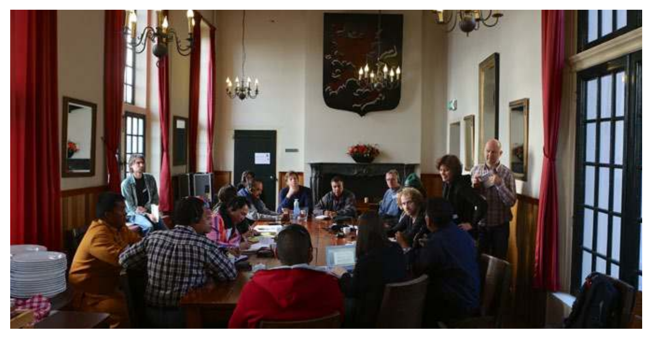
Delegates sharing their experiences in a working group

After the approval of the Heemskerk Declaration, all delegates were asked to elect one representative for the plant they grow to travel to New York and attend the UNGASS.