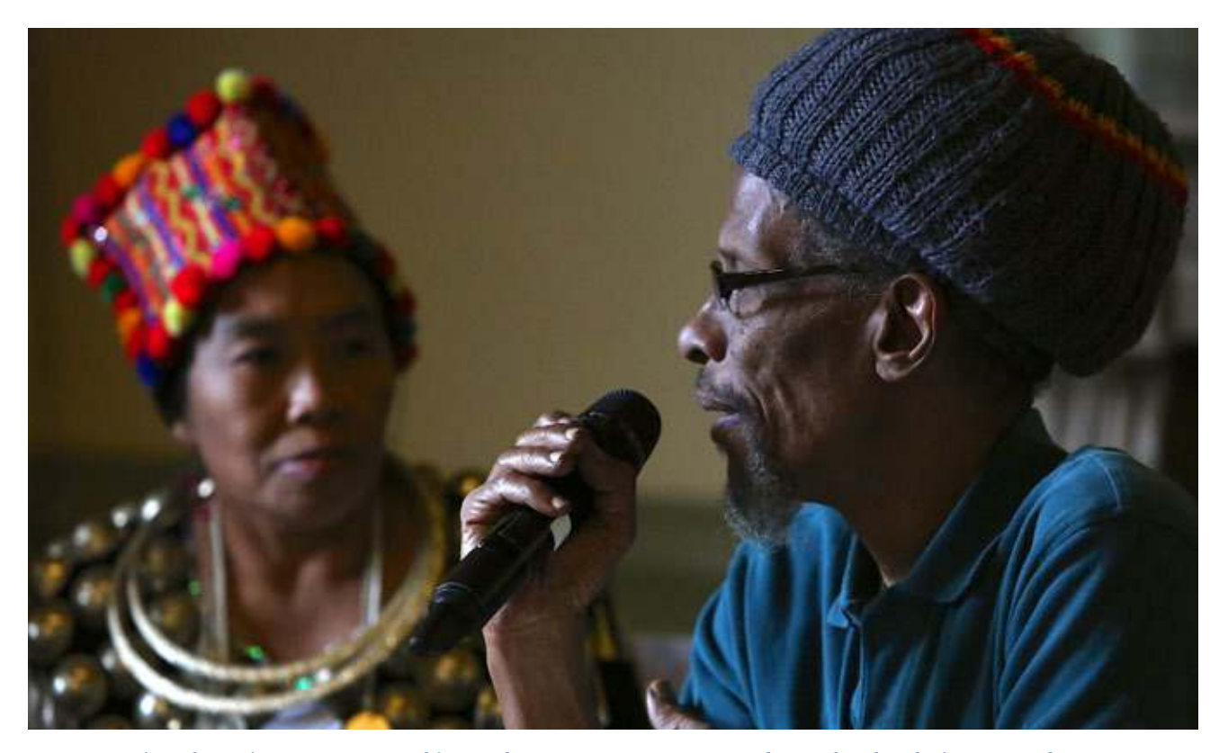
Representative of Jamaican Farmers speaking at the Growers Forum 2016

Illicit2, which took place in January 2009 in Barcelona. The Forum was attended by more than 70 leaders and representatives of farmers involved in the cultivation of cannabis, coca and opium poppy in Asia, Africa and Latin America & the Caribbean. More than 30 international experts, NGOs and government representatives also attended the meeting.