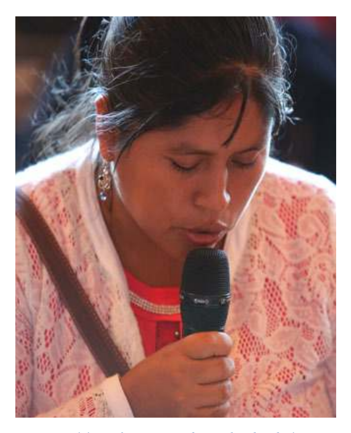
GFPPP participant from Peru

"In 1999 when we built a development association, we went directly to the Moroccan state and the European Union. They came to the area and we had some pilot projects. So they developed a strategy for the short, medium and long term to start with a pilot project to start with 30,000 residents. We started with the production of honey, and the promotion of tourism. But when it was implemented, we voluntarily planted 18,000 plants, we produced honey, but most founders didn't follow-up. We should continue it, because you need time before the first harvest is there. In this meantime (3, 4 years) the supporters from the government and EU disappeared. But in the meantime we kept on producing hashish because they left us alone and it took time to grow the trees. Because of this people lost the trust in the institutions and they realised that they themselves are responsible for these projects. In the meantime we keep on pushing. We are not necessarily asking for money, we want expertise and follow-up of the programme."