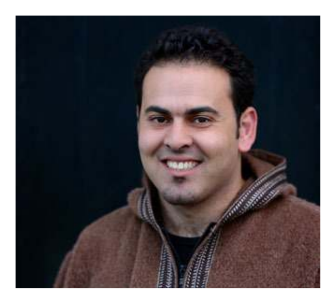
GFPPP participant from Morocco

therefore deprived of the opportunity to officially defend themselves.