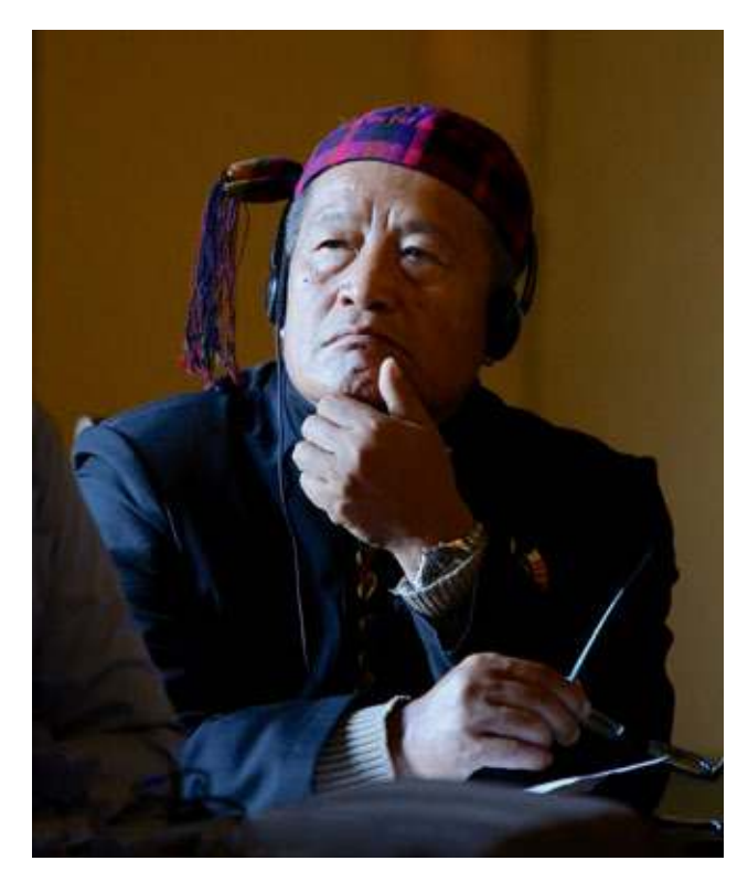
Delegate from Myanmar

"The government needs to think in big terms, it affects a huge amount of people throughout the entire country. We only receive names of projects, but nothing happens. So with the course of time, growers don't believe in the government anymore. The trust is gone because of all the failed projects."