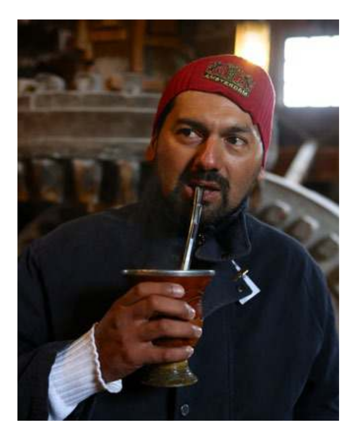
Delegate from Paraguay

Most of the GFPPP participants came from countries or regions where no AD projects