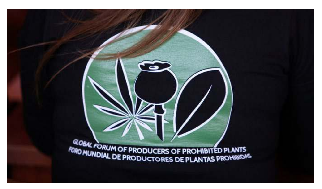
The T-shirt of one of the volunteers

"We have been advocating reforms from the government to the king. We are coming with