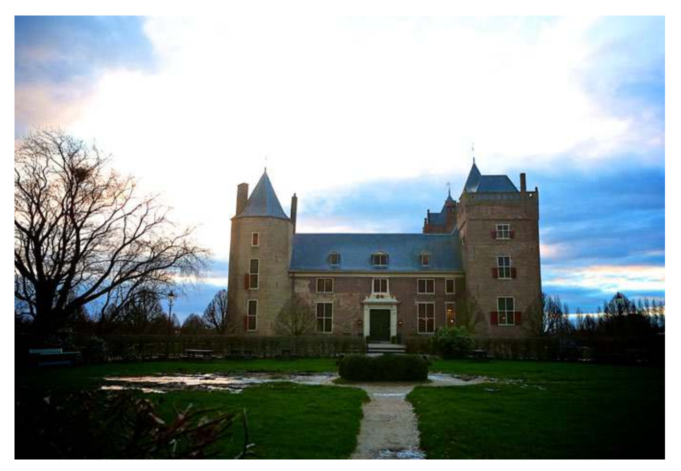
Slot Assumburg in Heemskerk

During the whole of day one, all four groups discussed each topic, resulting in several documents reflecting the debate and interventions.