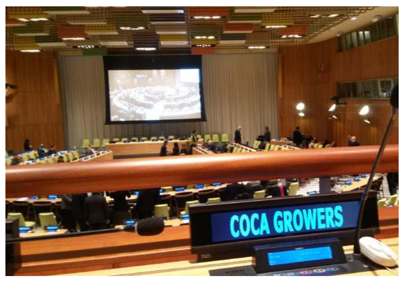
Coca growers represented at the UN Headquarters in New York

March 2016 in Vienna, during the two-day UNGASS preparation segment. CSTF members also presented the conclusions of their consultations with regional representatives and affected populations.