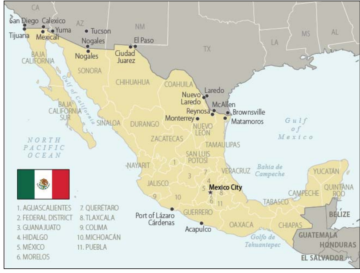
Figure 1. Map of Mexico

on trends in organized crime-related killings as opposed to all homicides, it is difficult to analyze the security situation with precision. Nevertheless, according to Mexico's national security system, homicides in Mexico declined by 16.5% in 2013 and 15% in 2014. Extortions and kidnappings, however, continued to increase until 2014.